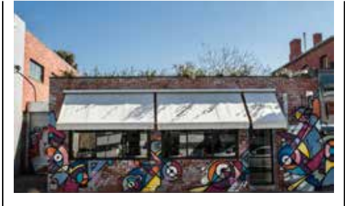
St Edmonds 154 Greville Street, Prahran