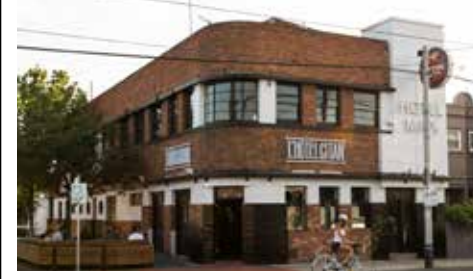
L'Hotel Gitan 32 Commercial Road, Prahran